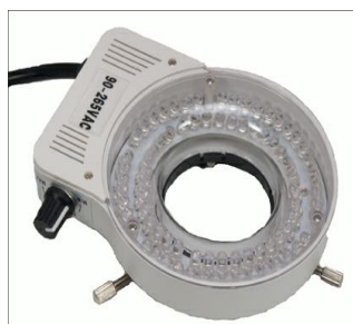
Ring Illuminator: LED or Fluorescent