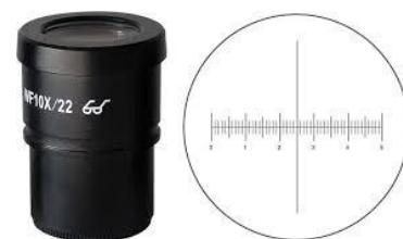
Micrometer Eye Piece