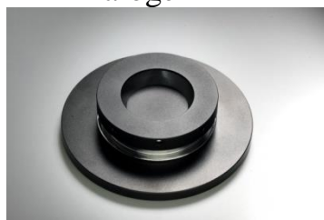
Dark Field Attachment