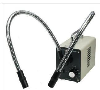
Fibre Optics Illumination Halogen