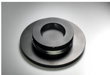
Dark Field Attachment