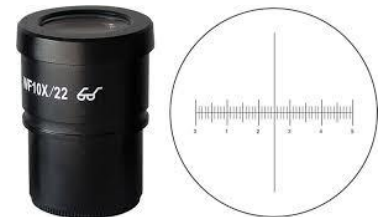
Micrometer Eye Piece