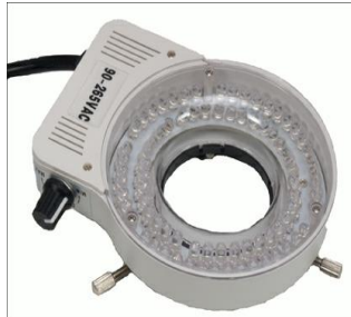
Ring Illuminator : LED or Fluorescent