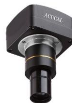
High Resolution Microscopy Camera