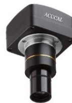
High Resolution Microscopy Camera