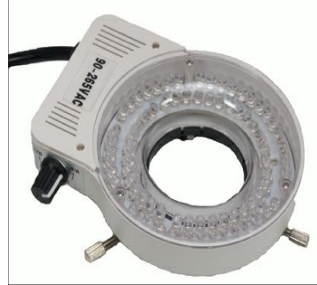
Ring Illuminator : LED or Fluorescent