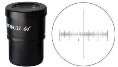
Micrometer Eye Piece