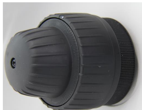
Coaxial Coarse and Fine Adjustment, With Safety Stop Screw, Tension Adjustable