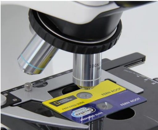
Backward Quadruple Nosepiece Large Size Double Layer Mechanical Stage