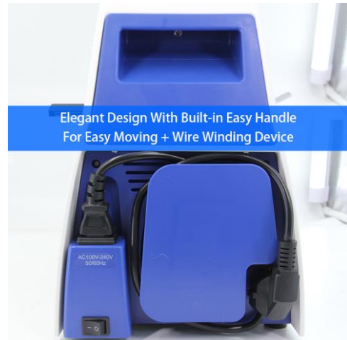
Elegant Design With Built-in Easy Handle For Easy Moving + Wire Winding Device