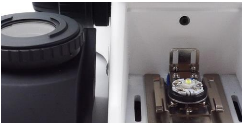
Brightness Adjustable Removable Cover For Easy Repair & Maintenance