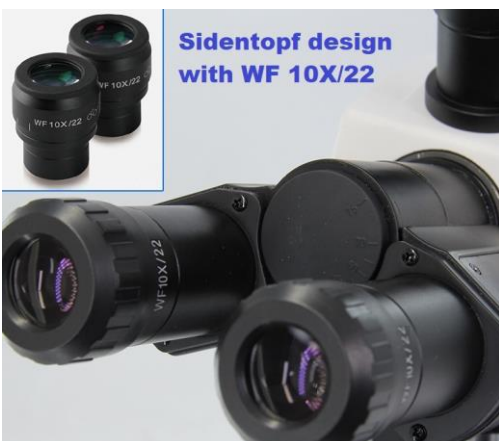
Sidentopf design with WF 10X/22