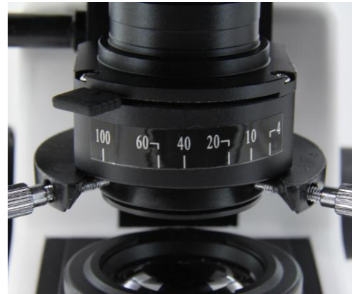
Abbe Condenser NA1.25, with Iris Diaphragm, Center Adjustable